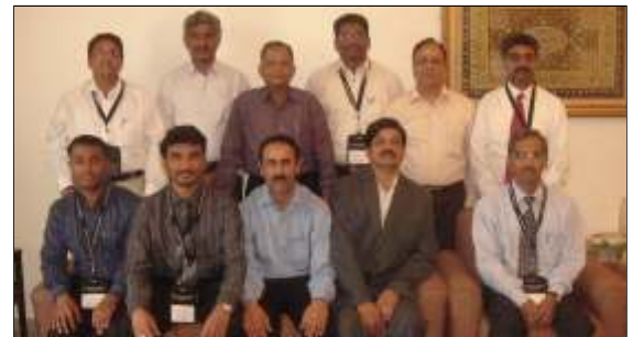
Fourth batch Level C/B Certification Assessors & Candidates from Ericsson Bangladesh, Ramky, NHPC, ITC, L&T, NTPC & Jindal Power, at Noida in March 2010.