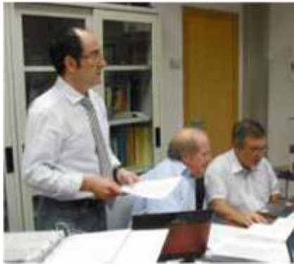
The Revalidation team at work