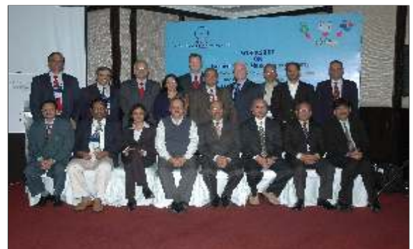
Participants for 2 Day workshop on Earned Value Management (December 15-16, 2009)

In the Indian context, EVM has a very large applicability and through red, yellow and green buttons depending upon the ratios of SPI and CPI can give a good idea of where we are and then we can focus as what strategies we should take to improve our project performance.